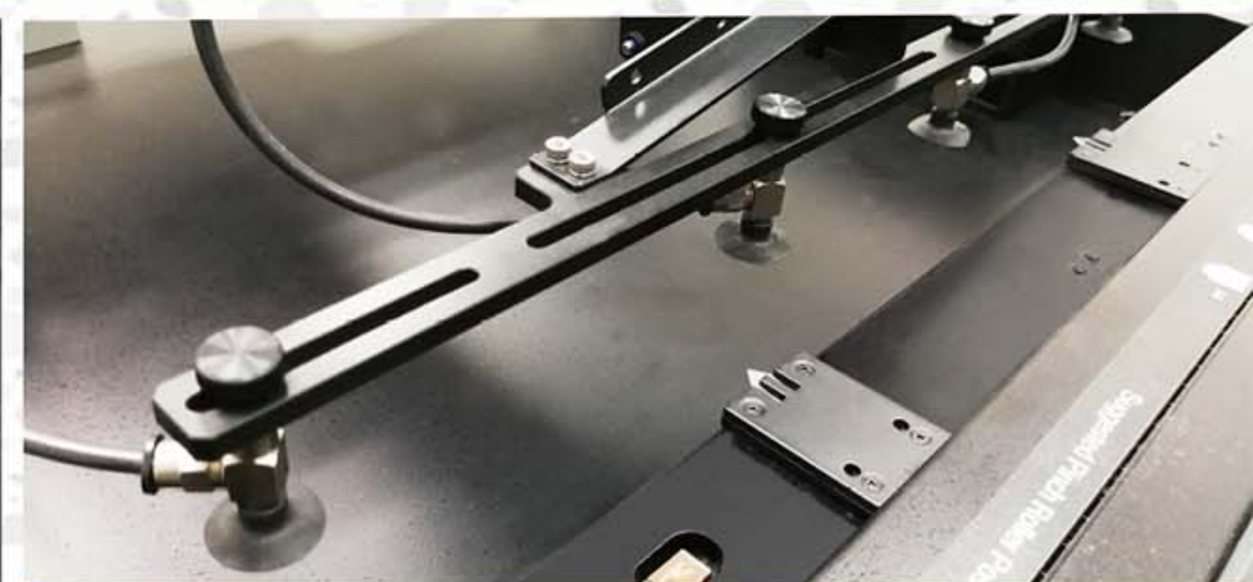
Suction cap for automated sheets feeding process