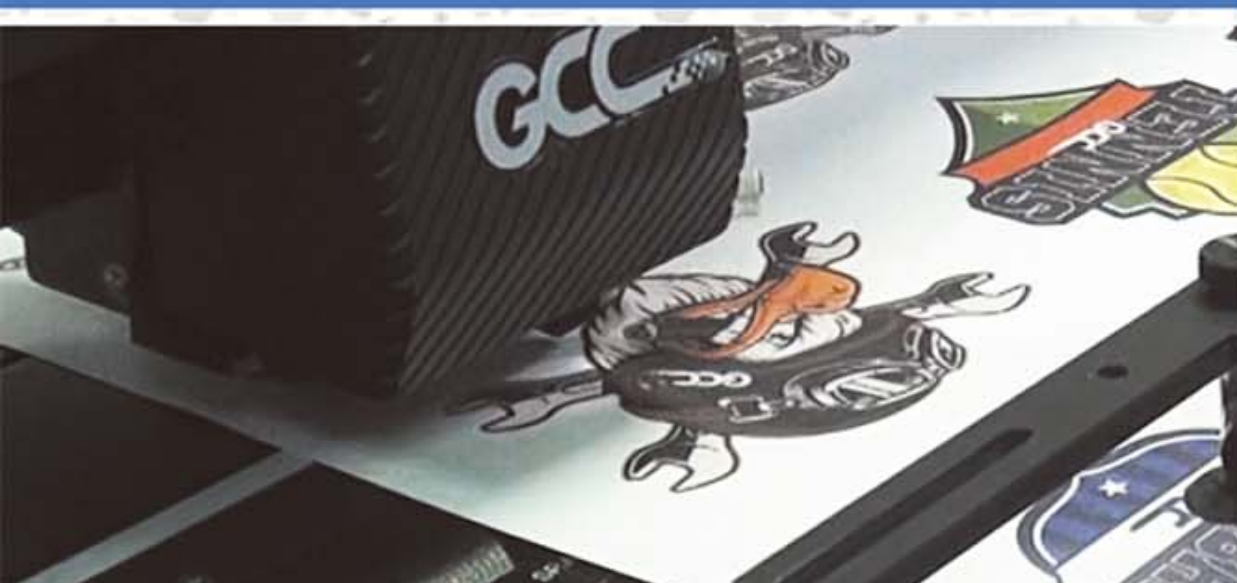
Precise contour cutting on printed media