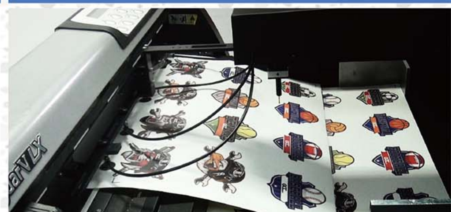
Single sheet feeding guaranteed