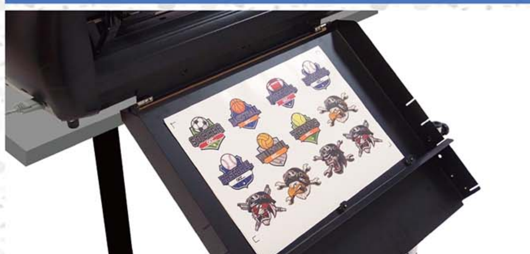
Media basket collects completed cutting sheets