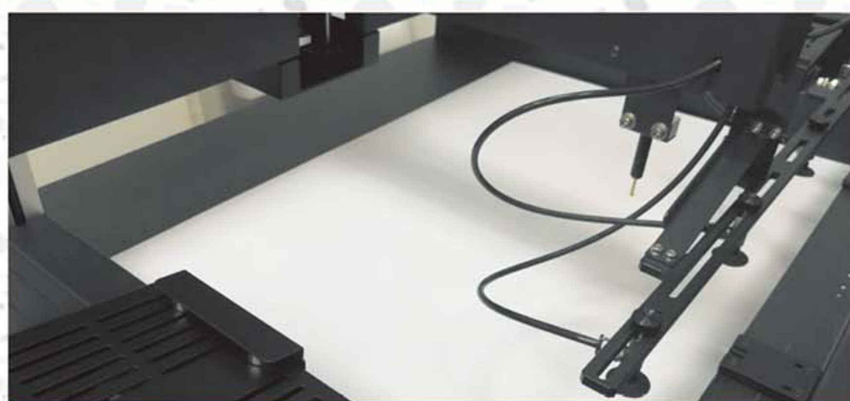
Support media standard up to B2 size